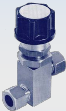
2300 5mm Bore, in-line Connector Size 5/16in, 8mm