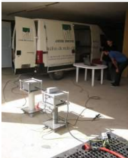
ICMflex & HV filter