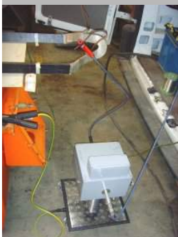
TD measurement on motor bars