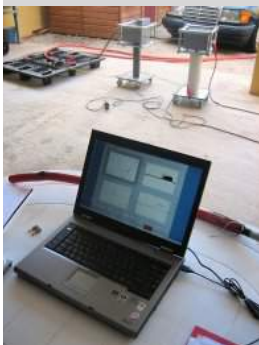
On-site cable testing