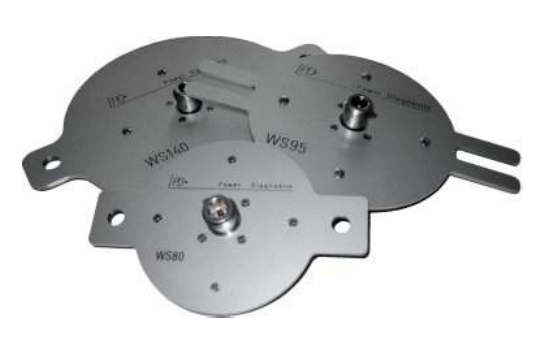
WS window sensors in different sizes

External window sensors are used to conveniently equip older GIS with UHF monitoring. Power Diagnostix offers such window sensors of different sizes to fit the inspection windows of older GIS. Instead of embedded sensors, additionally, modified earthing switches can be used. In case of non-shielded support insulator disks a proven method is to apply ring antennas to capture the UHF signals at the flanges.