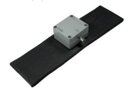
Foil sensor DFS1

Besides the embedded coaxial sensor of cable accessories, external sensors can be applied to joints and terminations. Especially on crossbonding joints differential foil sensors serve to capture partial discharge signals in elevated frequencies. Such foil sensors can be permanently installed for monitoring or temporary applied for survey type measurements.