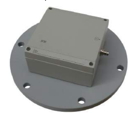
Flange sensor TFS1

and designed in accordance of special customer specifications.